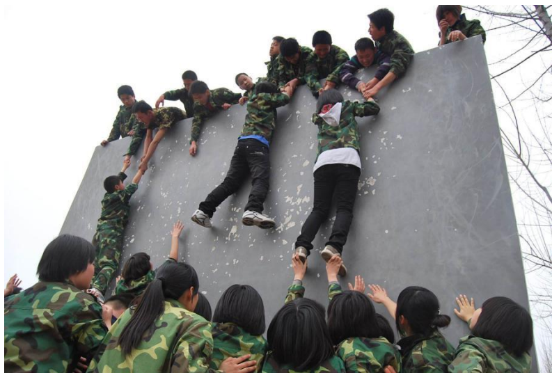
Figure 2. The Seventh Graders are Crossing the "Graduation Wall".

this kind of high-pressure control, once, a girl suddenly fainted. Because of a sudden incident, everyone was caught off guard and swarmed; some people pinched Renzhong acupuncture point, and some people performed cardiopulmonary resuscitation; there were no boys and girls scrupulous at the time, and then a boy picked the girl up. So I took her to the hospital. After that, the opening scene appeared. Later, experts suggested that the school demolish the wall between male and female dormitories, promote regular exchanges between male and female students, and carry out ballroom dancing activities. This phenomenon has never happened again.